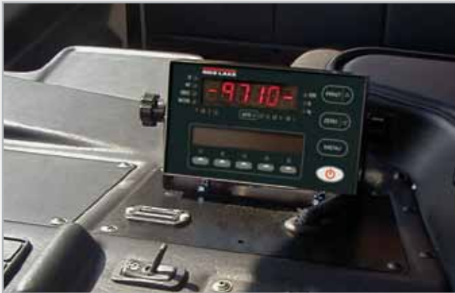
9710 In-Cab Digital Indicator