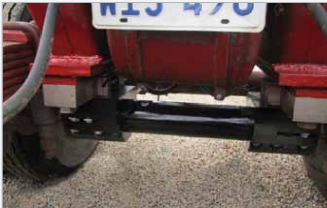
Single Point Trunnion Load Cells