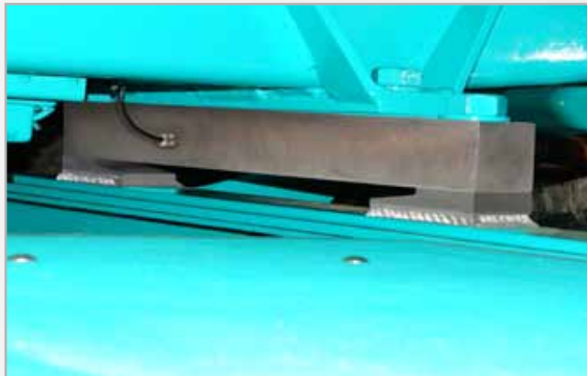
Underbunk Load Cell Mount