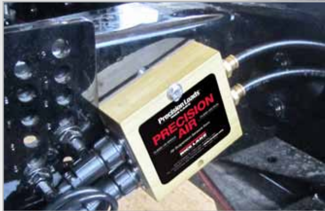
Dual Sensor Air Pressure Transducer