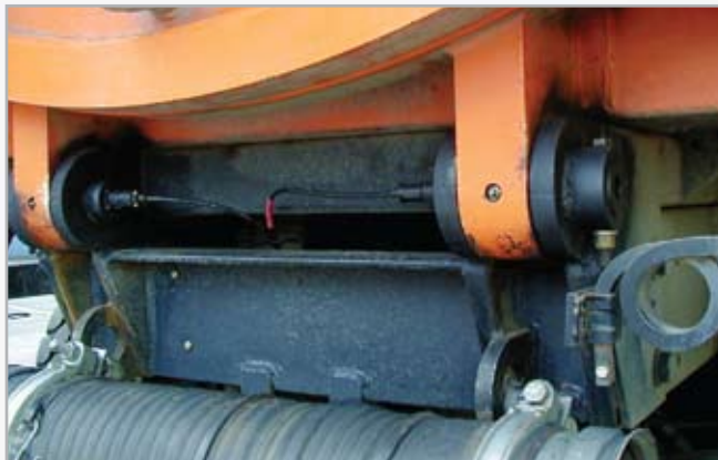
Hinge Pivot Loadpins