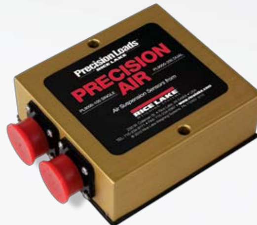
Dual Sensor Air Pressure Transducer