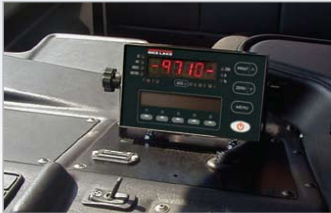
9710 In-Cab Digital Indicator

Our simple, step-by-step installation manual guides the installer through the sensor mounting process to ensure optimum safety and precision of the weighing system. Add to that our five-year warranty against sensor breakage for a win/win, no waste, on-board weighing system every bulk hauler should have.