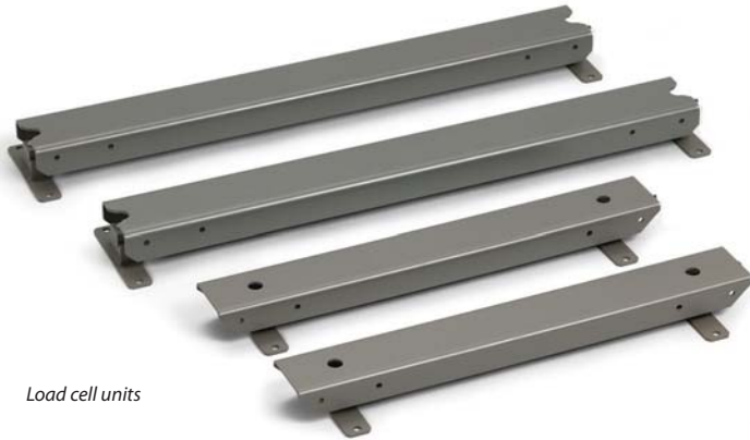
Load cell units