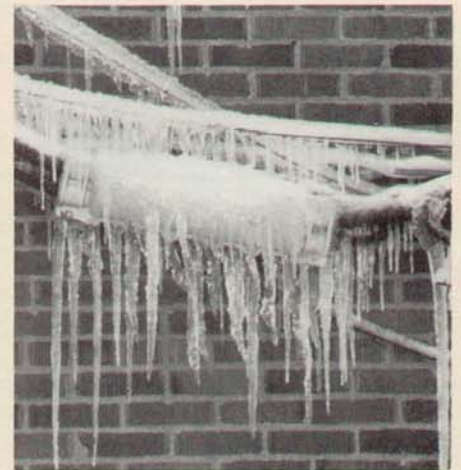
A Winslow hydraulic load cell can give you accurate weighing in temperatures as hot as 200°F or as cold as -90°F.

Even extreme climates can't stop this scale from weighing accurately for you. Because we've engineered the load cells with technology similar to that used in the complex, hydraulically actuated controls of modern jetliners, which like your scale must perform reliably in sub-zero temperatures. So the truth is, you can count on Portaweigh II to operate properly in temperatures as hot as 200°F or as cold as -90°F. That means whether you're in Alaska or Death Valley, Portaweigh II can do the job for you.