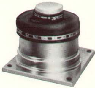
Series 136 Stainless Steel Load Cells Capacity—75,000 lbs.