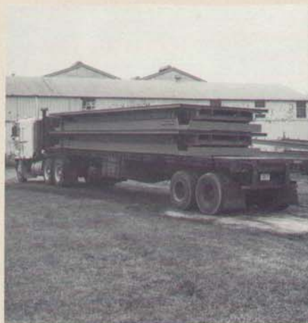
Moving your Portaweigh II from job site to job site is no hassle because take-down and set-up are simple.

So when you're ready to take care of your weighing needs, talk to the dealer who gave you this brochure or write: