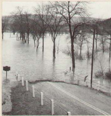
Even under all this water your Portaweigh II won't be washed up because water can't damage the hydraulic load cells in a Hytronic Scale.