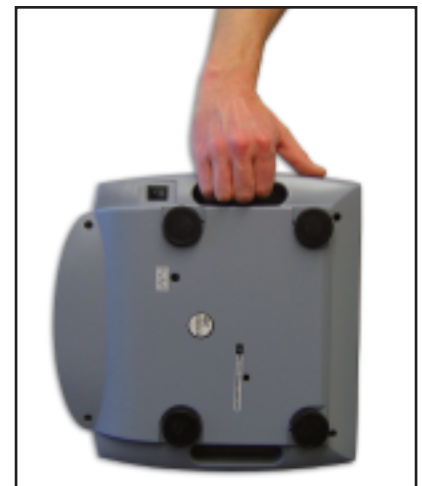
Integrated handles in the housing allow easy transport of the EC Scale