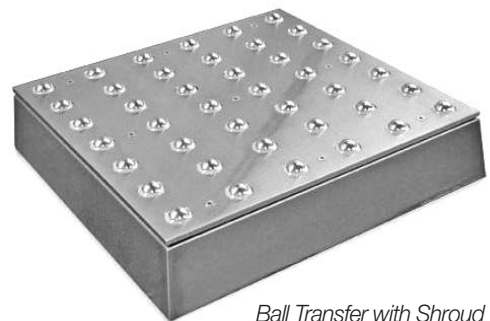
Ball Transfer with Shroud