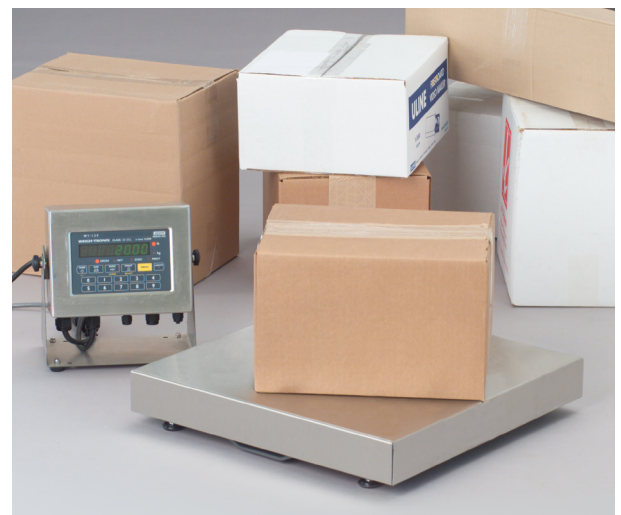
3735LP model shown with optional Avery Weigh-Tronix WI-125 indicator.